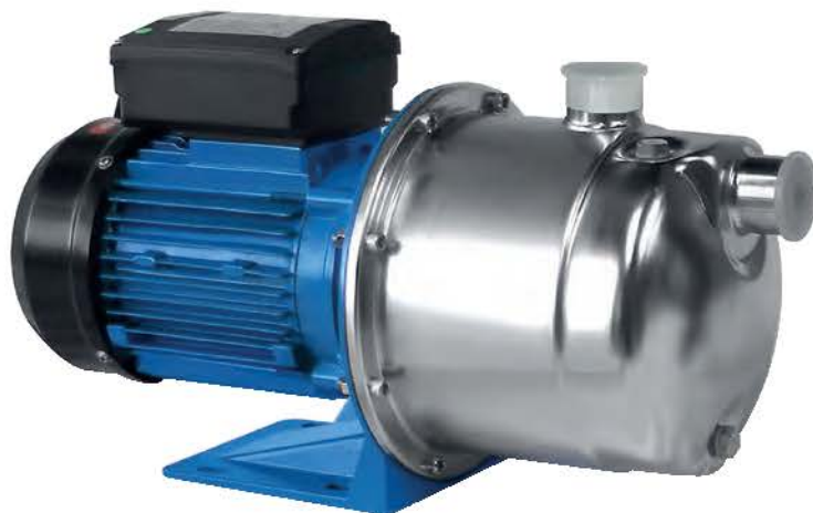
PART No. 7575107 WATERBOY™ 80L JET PUMP