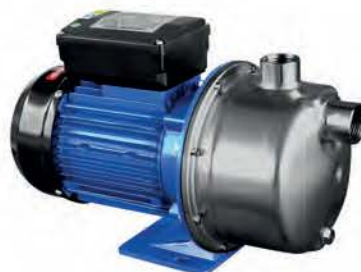
PART No. 7575101 WATERBOY™ 40L JET PUMP