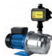
PART No. 7575108 WATERBOY™ 80L JET PUMP WITH 3KW PRESSURE CONTROLLER