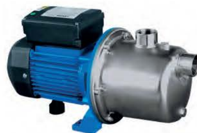
PART No. 7575100 WATERBOY™ 60L JET PUMP