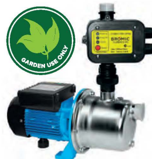
PART No. 7575114* TANK BOY™ 40L JET PUMP WITH 3.0KW PRESSURE CONTROLLER KIT