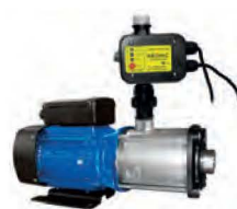
PART No. 7575210 WATERBOY™ MULTI-STAGE JET PUMP WITH 3KW PRESSURE CONTROLLER