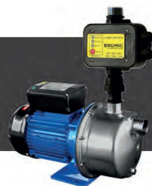
PART No. 7575105 WATERBOY™ 40L JET PUMP WITH 3KW PRESSURE CONTROLLER