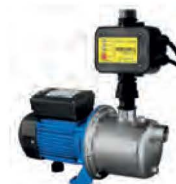
PART No. 7575106 WATERBOY™ 60L JET PUMP WITH 3KW PRESSURE CONTROLLER