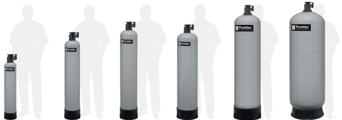
NTS1000 In/out head, 15 Lpm, 25mm connection